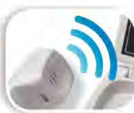
Amplifies Sound Up to 40dB gain captioned calls