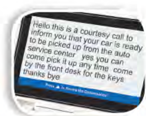
Large Color Display Screen Easy to read