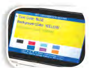
Adjustable Fonts / Colors Customize for easiest reading