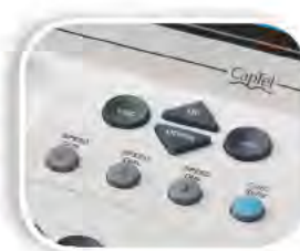
Speed Dial Buttons 1 touch dialing